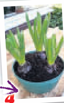
Add to bowls