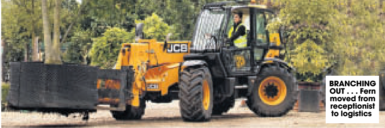
BRANCHING OUT... Fern moved from receptionist to logistics