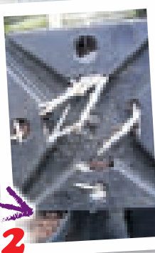
Good root system