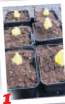
Time to bring indoors

● IT'S time to pot bulbs like hyacinths to flower indoors over the winter. Use prepared bulbs, water and put in a cool, dark place until the yellow shoot is about 2in high (8-10 weeks). Keep them in a cool place indoors until the tips turn green. When flowers start to show, the bulbs can be planted into bowls of single or mixed colours. You can pick bulbs to balance growth since no two colours develop at the same rate. See our hyacinth offer below.