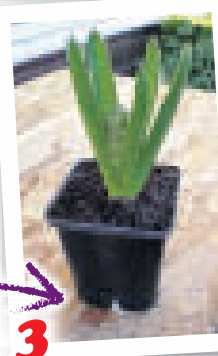
Ready for potting